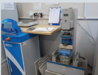
Typical mortar testing facilities