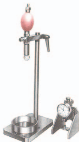
Dropping ball apparatus used in the testing of fresh mortar

Testing mortar in its fresh state is covered in both BS 4551 and BS EN 1015. Fresh mortar properties are those that affect the ability to